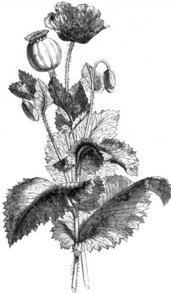
THE OPIUM POPPY ( papaver somniferum .)

The opium poppy is a native of Persia, and probably also of the south of Europe and Asia Minor. It is largely cultivated in those countries, and also in Egypt, Arabia, and British India, for the sake of its opium. Dr. Joseph Hooker