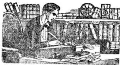
NEW YORK, SEPTEMBER 16, 1848.