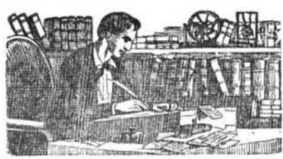
NEW YORK, AUGUST 19, 1848.