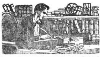
NEW YORK, AUGUST 19, 1848.