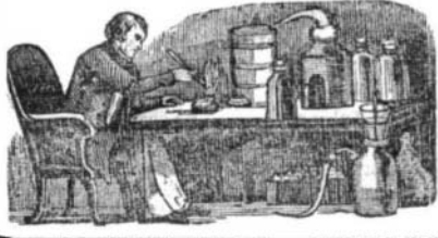
For the Scientific American.