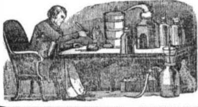
For the Scientific American.