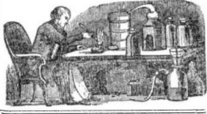
For the Scientific American. More about Cameos.