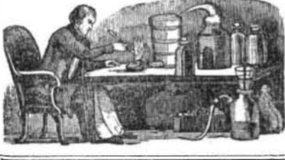
Artificial Cold. (Concluded from our last.)