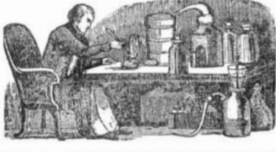
For the Scientific American. Curiosities of Mechanism.