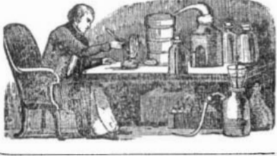
For the Scientific American. Curiosities of Mechanism.