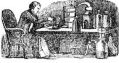
For the Scientific American. Axioms to be observed in making Copal Varnishes.

The more minutely the gum is run, the greater the quantity and stronger the produce. The more regular and longer the boiling of the oil and gum together, the freer the varnish will work. When the mixture of oil and gum is too suddenly brought to string by strong heat, the varnish will require more than a just proportion of turpentine to thin it, whereby its oily and gummy quality is reduced, which renders it less durable, and it will not flow so well in laying on. The greater the proportion of oil used in varnishes, the less liable are they to crack, because tougher and softer. By increasing the proportion of gum, the thicker will be the stratum of varnish, the firmer it will set and the quicker dry. When varnishes are perfectly new and must be applied before they are of sufficient age, they should be left thicker than if kept a proper time before using.—African copal possesses the best qualities of elasticity and transparency. Too much driers in varnish render it unfit for clear and delicate colors. Copperas does not combine with, but only hardens varnish. Turpentine improves by age and varnish by being kept in a warm place. All copal and oil varnishes should be kept some time after they are made before they are used.