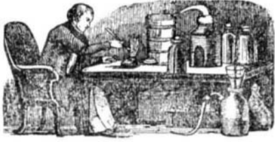
For the Scientific American. Axioms to be observed in making Copal Varnishes.

The more minutely the gum is run, the greater the quantity and stronger the produce. The more regular and longer the boiling of the oil and gum together, the freer the varnish will work. When the mixture of oil and gum is too suddenly brought to string by strong heat, the varnish will require more than a just proportion of turpentine to thin it, whereby its oily and gummy quality is reduced, which renders it less durable, and it will not flow so well in laying on. The greater the proportion of oil used in varnishes, the less liable are they to crack, because tougher and softer. By increasing the proportion of gum, the thicker will be the stratum of varnish, the firmer it will set and the quicker dry. When varnishes are perfectly new and must be applied before they are of sufficient age, they should be left thicker than if kept a proper time before using.—African copal possesses the best qualities of elasticity and transparency. Too much driers in varnish render it unfit for clear and delicate colors. Copperas does not combine with, but only hardens varnish. Turpentine improves by age and varnish by being kept in a warm place. All copal and oil varnishes should be kept some time after they are made before they are used.