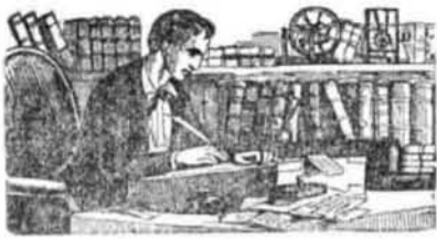
NEW YORK, APRIL 15, 1848.