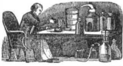
For the Scientific American.