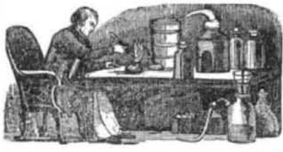
For the Scientific American.