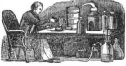
For the Scientific American.