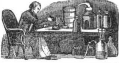
For the Scientific American.