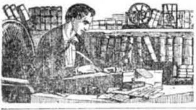
NEW YORK, APRIL 1, 1848.