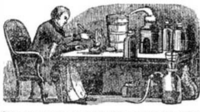
For the Scientific American. Enamel Fluxes.

Enamel painting differs from all other kinds in the vehicle employed for the colors, and bind them to the ground they are laid upon. This is glass or some vitreous body which being mixed with colors and melted by heat becomes fluid and having incorporated with the colors in that state, forms together with them a hard mass when cold. It answers the same end in enamel that oil or size does in other kinds of painting.