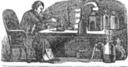
Needle and Pin Making.

Needles go through a number of operations before they are complete. Some commence with steel wire hardened, others harden it afterward. The wire is first reeled into a coil, which is cut apart in two places with shears, and then drawn a second time, after which it is cut into lengths just sufficient for two needles in each piece: these pieces are then straightened by rolling a bundle of them together upon a hard surface, being afterwards sharpened upon a revolving grindstone. The pieces are now cut in two at the middle, the blunt ends flattened by a hammer, preparatory for the eye, which is afterward pierced by machinery. They are then tempered by plunging them into a bath of melted metal, and immediately after into cold water; then thrown into a wabber—a barrel rapidly revolving upon an axis not placed through its centre—with emery and a putty made from the oxide of tin, by which they are burnished. They are then taken out, separated by a winnowing apparatus, and put up in papers for sale; the quantity not being counted but regulated by weight. The eye was formerly pierced by children, who became so expert that with one blow of a punch they would frequently pierce a hole, through which they would thread a hair from the head and hand it to their visitors.