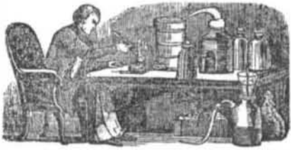
For the Scientific American. Japanning.