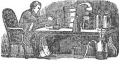
For the Scientific American. Japanning.