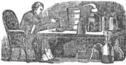
For the Scientific American. Japanning.