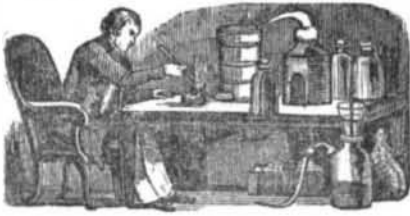
For the Scientific American. Jappanning. (Continued from our last.) BLACK GROUNDS.

Black grounds for japans may be made by mixing ivory black with shellac varnish, or for coarse work, lamp black and the top coating of common seedlac varnish.