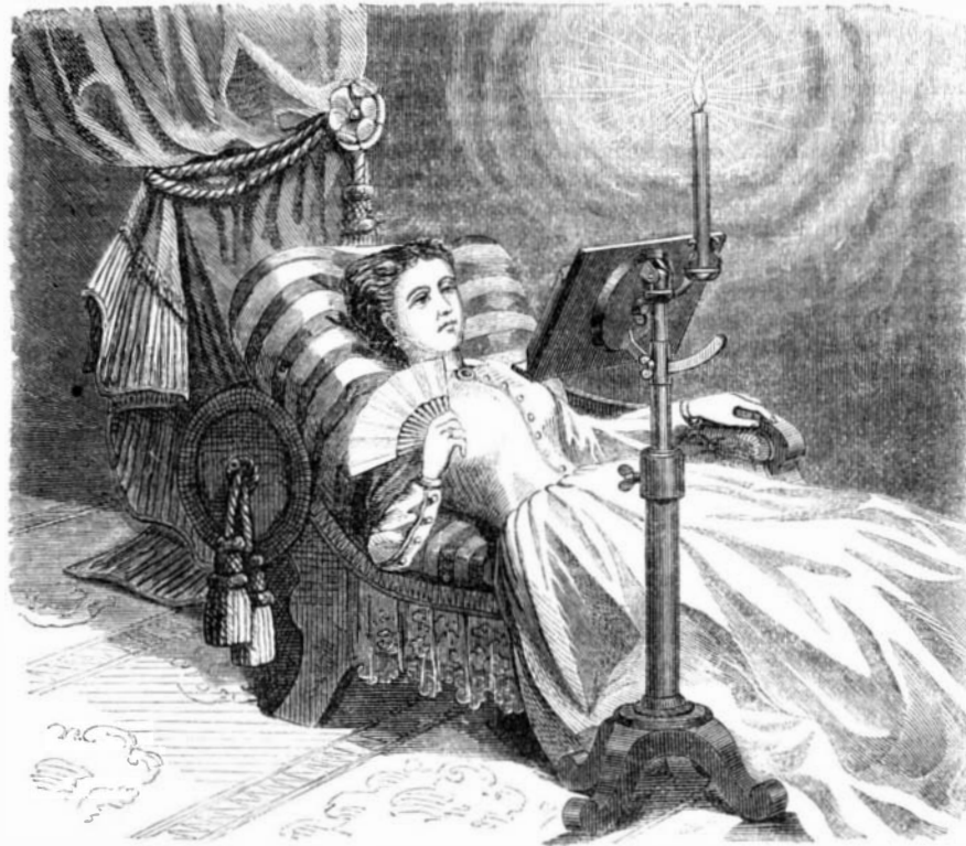
CONLEY'S MUSIC AND READING STAND.

The improvement will attract the attention of engineers