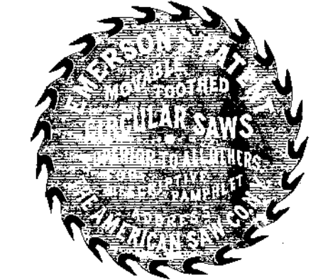
Factory, Trenton, N. J. Office, No. 2, Jacob st., N. Y. 25 tf

THE HOLLY MANUFACTURING CO., Lockport, N. Y., supply on call their Celebrated Rotary, Fan, and Centrifugal Pumps, for manufacturing purposes, fire protection, etc. Full information may be obtained by sending for Illustrated Catalogue. 31008