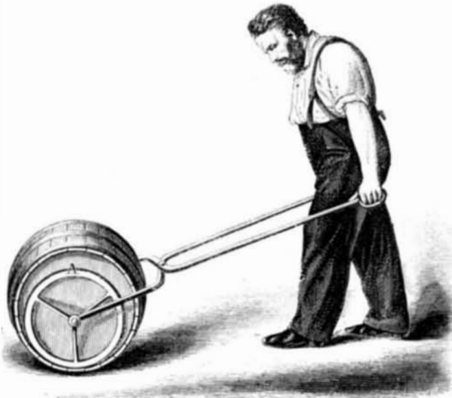
STEPHENSON'S BARREL ROLLER.

Owing to the simplicity of the device it can be constructed with little difficulty, and manufactured at little expense.